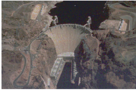
Hoover Dam is considered one of the greatest engineering works of all time.

This year The Rental Show is once again in Las Vegas, the glittering city of fun and excitement. Most people think it's all about casinos. But there is much more to Vegas than "gaming" (which is the term the casinos like you to use) or "gambling" (if you are a realist). In case you need some ideas, take a look at this tour guide. And if gaming is your thing, we have some tips for you too!